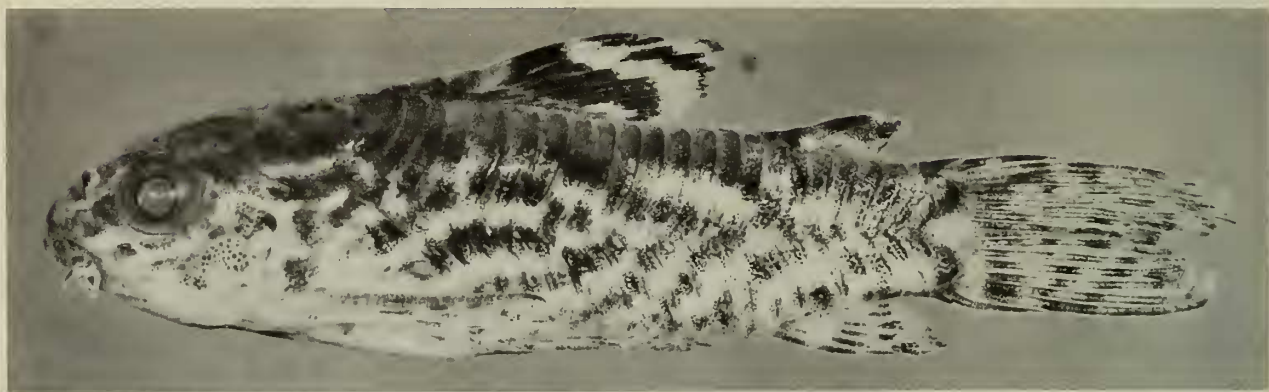
Fig. 3. Aspadoras pauciradiatus , ♀MZUSP, SL 17.4 mm, Brazil, State of Amazonas, Rio Negro, São João, near Tapurucuara.

believe these measurements may show useful interspecific and interpopulational differences and similarities in Aspadoras , Corydoras , and Brochis .